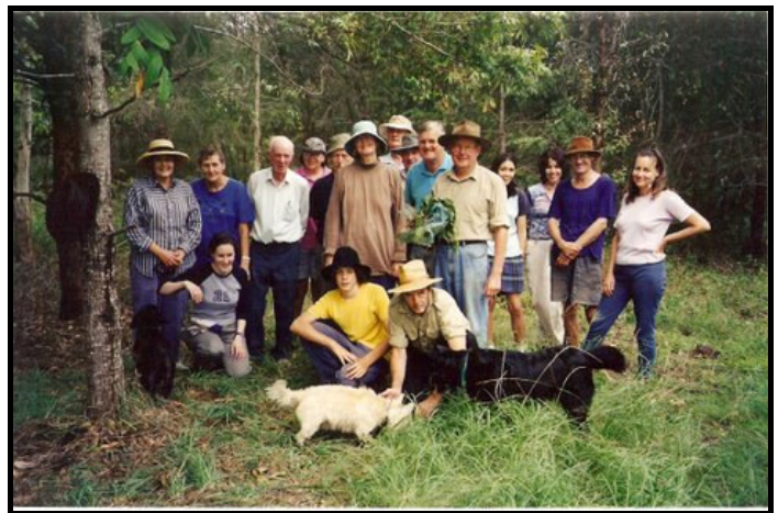
The team that works at Gold's Scrub, Lake Samsonvale.