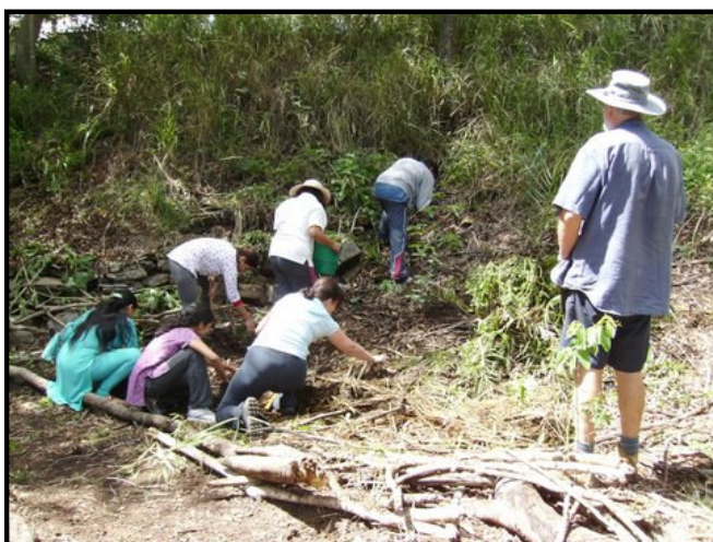
Working on a planting site.