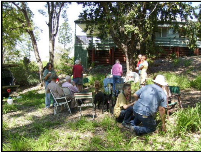
Stopping for a well deserved tea break.