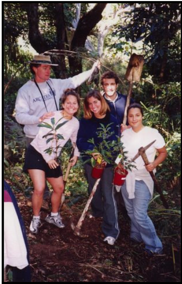
Students chip in on the fun.