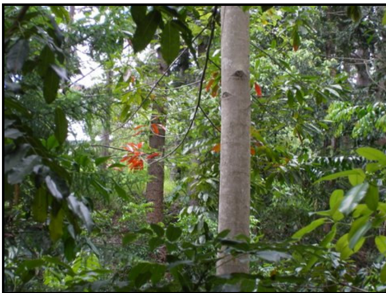
Some of the thick forest areas growing due to MOTT's efforts.