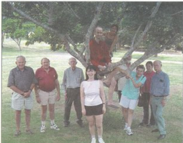
Members of a volunteer tree planting group called The Men of The Trees visited Beaudesert on Saturday.

"If we were asked by the council or a group to help out, we would try to fit them into our schedule," she said.